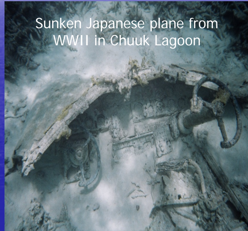
Sunken Japanese plane from WWII in Chuuk Lagoon