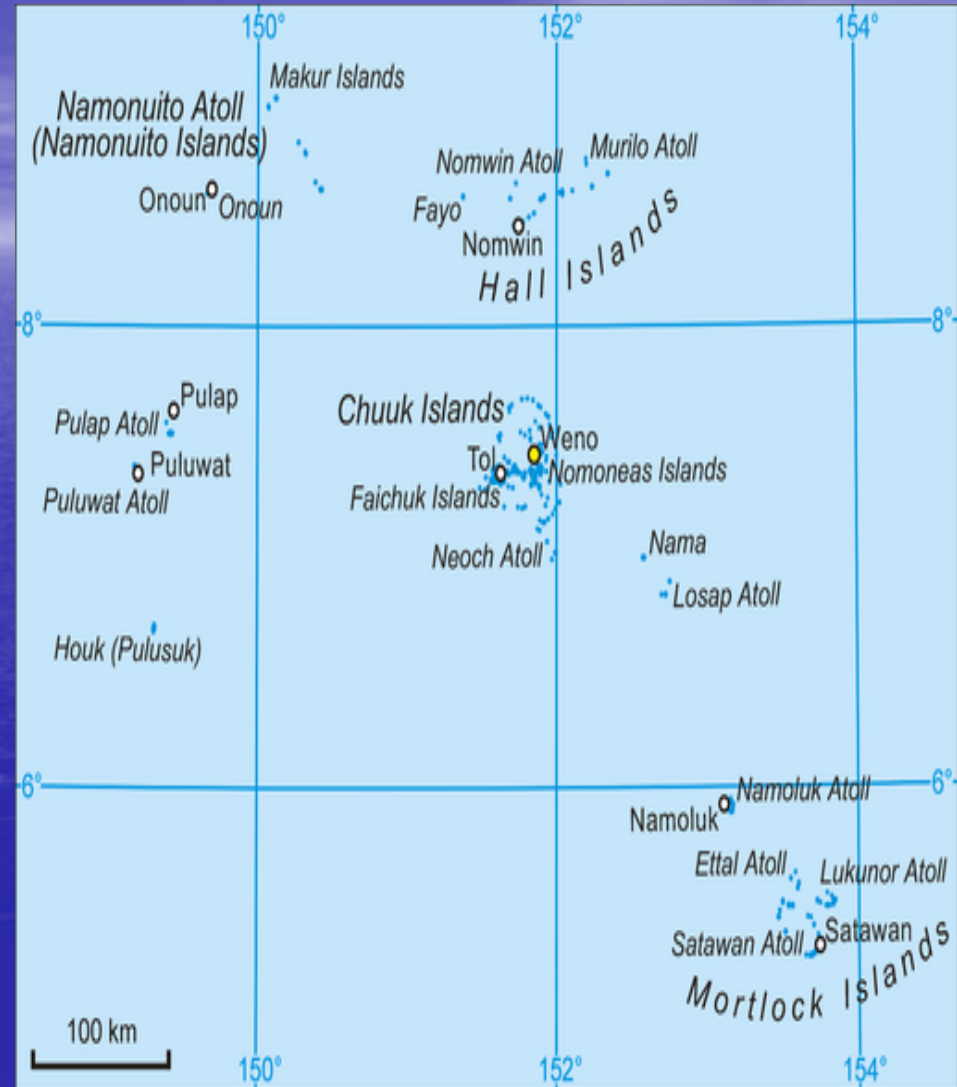
Federated States of Micronesia in the Pacific Ocean.