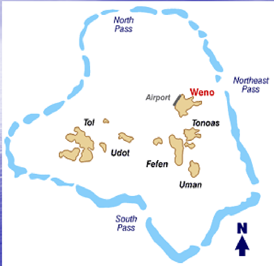
Map of the islands in Chuuk lagoon